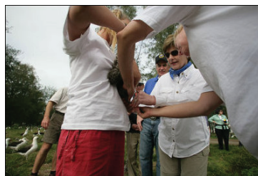
First Lady Laura Bush tags an albatross chick on Midway