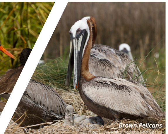
Brown Pelicans