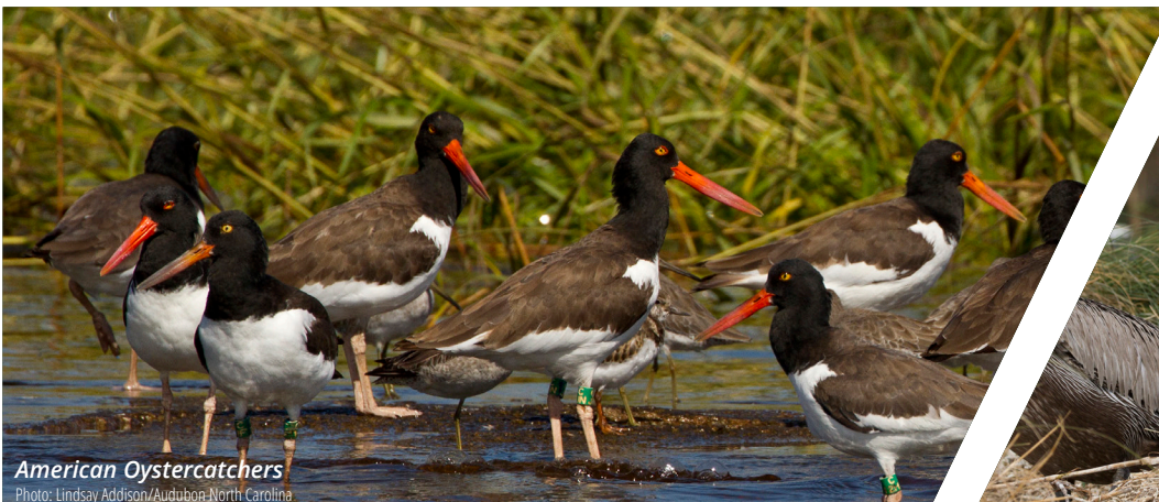
American Oystercatchers

Audubon protects and manages an extensive network of islands in the Lower Cape Fear River that provide nesting, breeding, and feeding habitat for 25 percent of North Carolina's nesting coastal water birds. These habitats serve as nurseries for fisheries that are commercially important to the state, such as blue crab and southern flounder. Fishing, hunting, boating, and other recreational uses of the estuary are estimated to generate $100 million to $120 million in economic expenditures in the region annually. 1