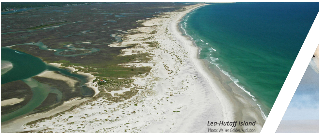
Lea-Hutaff Island

storms are among the top threats to the region, which has seen 11 inches of sea-level rise since the 1950s. 2 More intense coastal storms have eroded habitats and caused loss of human life and damage to infrastructure. Since 2016, this region has experienced three major storms – hurricanes Matthew in 2016, Florence in 2018, and Dorian in 2019. These hurricanes caused heavy rainfall and storm surges that overflowed the Cape Fear River, damaging homes and businesses, making roads impassable, and causing widespread power outages from Bald Head Island to Wilmington and beyond. Marshes throughout the estuary enhance natural flood protections for low-lying communities along the banks of the Cape Fear River, and barrier islands along the Atlantic Coast protect communities on the mainland from damaging coastal storm surges.