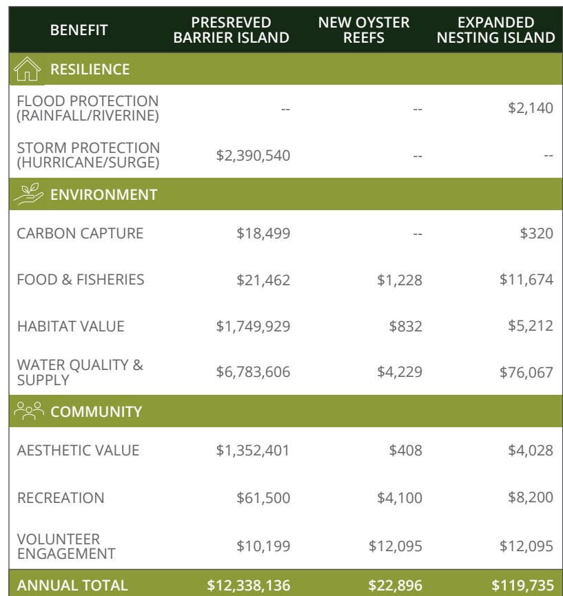
Table 1. Annual benefits from the Projects.

Additionally, acquisition and protection of Lea-Hutaff Island will not only preserve important habitats for shorebirds like the Wilson's Plover and Least Terns, but it will also preserve the first line of defense for the mainland during coastal storms. Preserving this valuable natural barrier will deliver more than $12.3 million in annual economic benefits to the region and over $278 million in total economic benefits over a 35-year period (assuming a 3% discount rate).