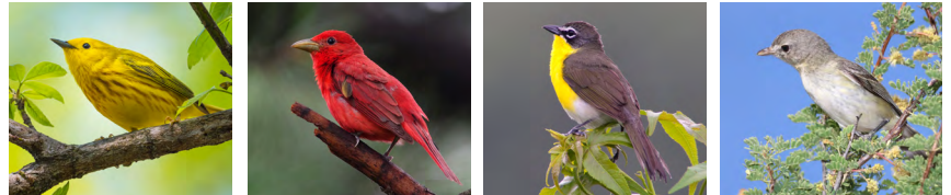
Left to right: Yellow Warbler, Summer Tanager, Yellow-breasted Chat, Bell's Vireo